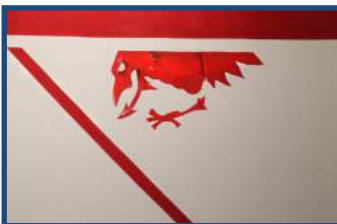
St. George's Dragon