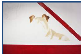
St. George's Dragon