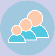
Preparing for adulthood