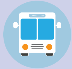
Travel and transport