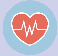
Health and wellness