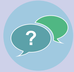
Information and support