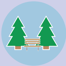
Places to go, things to do