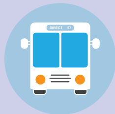
Travel and transport